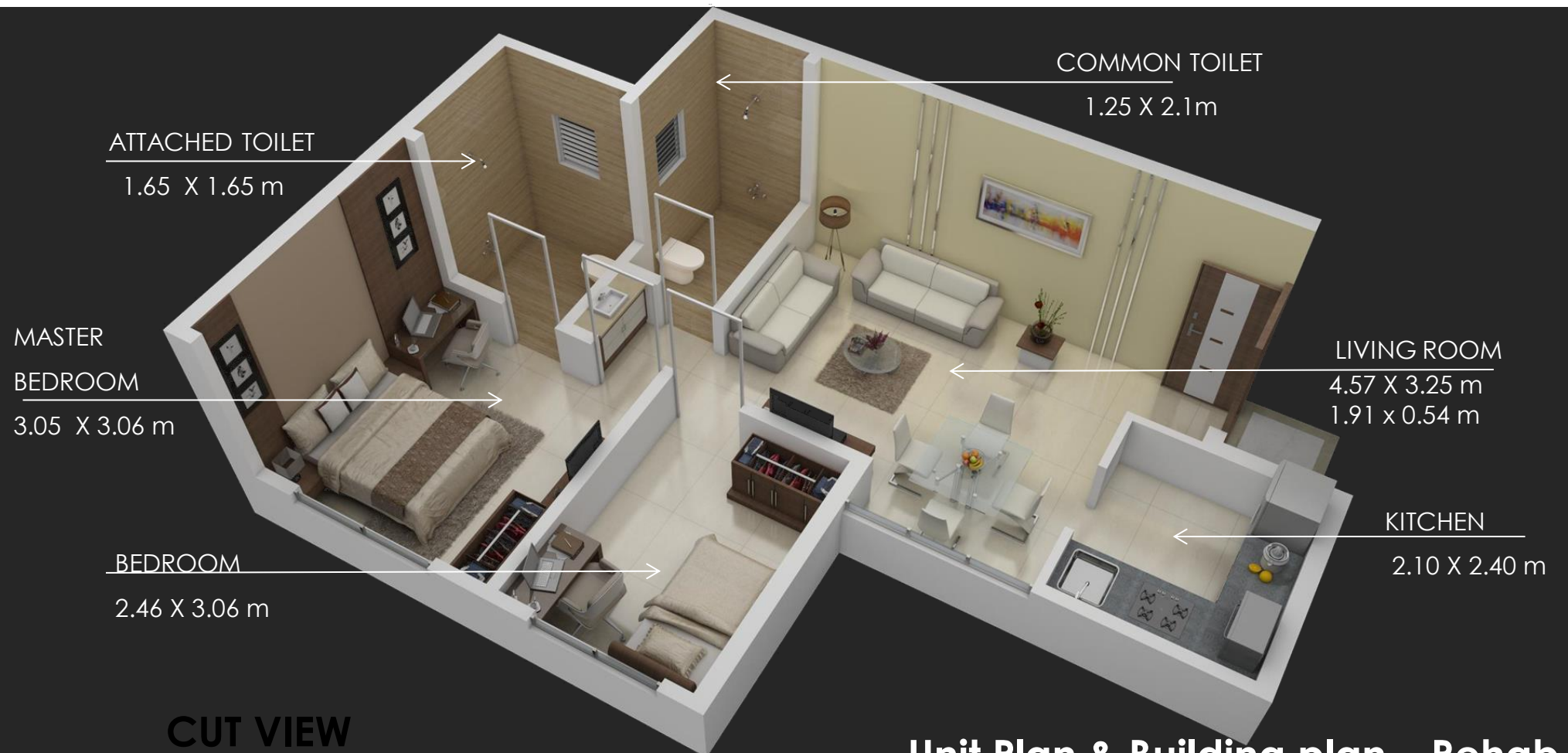
Unit Plan & Building plan – Rehab